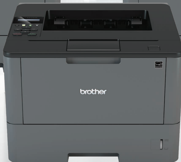
HL - L5200DW