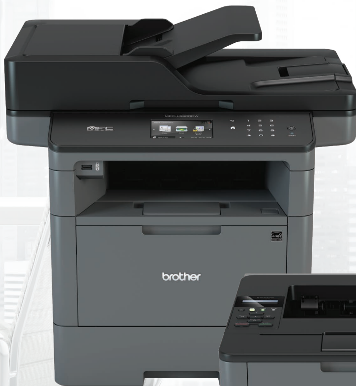
MFC - L5700DN

The L5000 mono laser series helps you maximise print efficiency and minimise costs so you can make the most of your investment