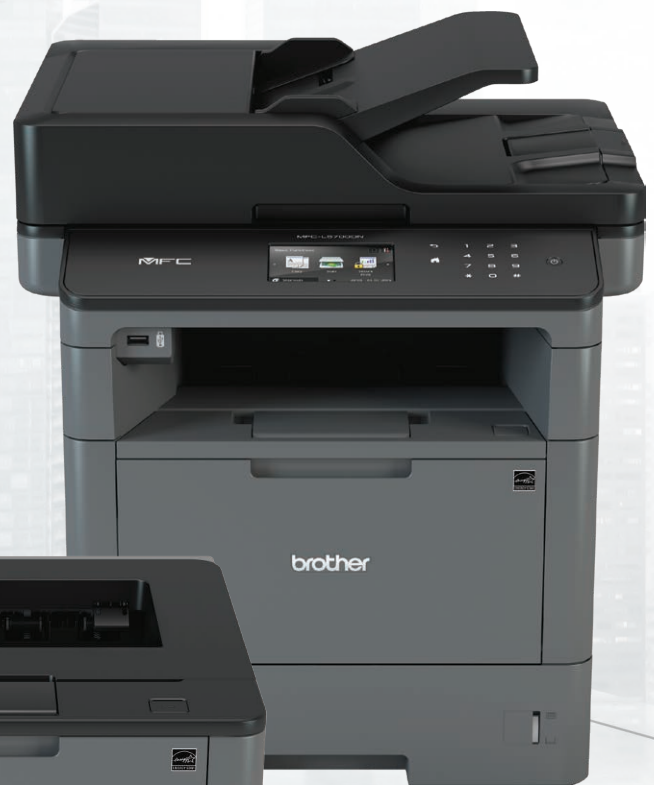
MFC - L5900DW