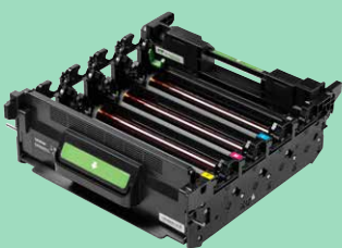
Drum Unit DR665CL Approx. 50,000 pages (3 pages/job)