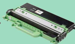
Waste Toner Box WT229CL Approx. 50,000 pages (5 pages/job)