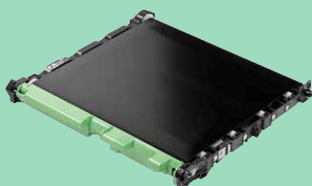
Belt Unit BU635CL Approx. 100,000 pages (3 pages/job)