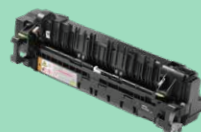
Fuser Unit FD-5000 Approx. 100,000 pages (5 pages/job)

Paper Feed Kit for MP Tray PF-M5000 Approx. 50,000 pages (5 pages/job)