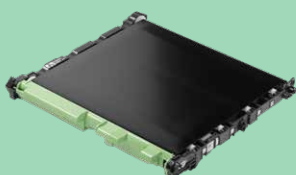
Belt Unit BU635CL