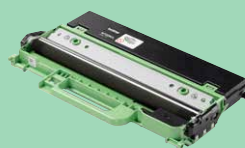
Waste Toner Box WT229CL