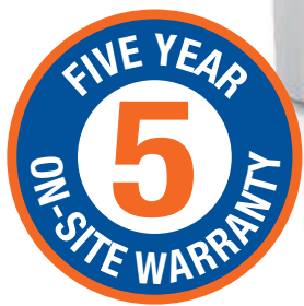
HL-6400DW Black & White Laser Printer