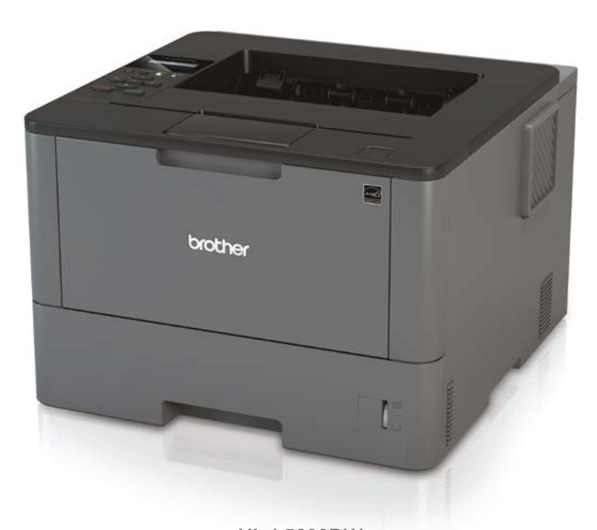
HL-L5200DW Black & White Laser Printer